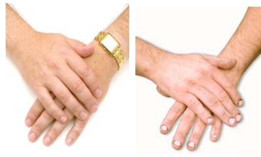
Who's hand would you shake?